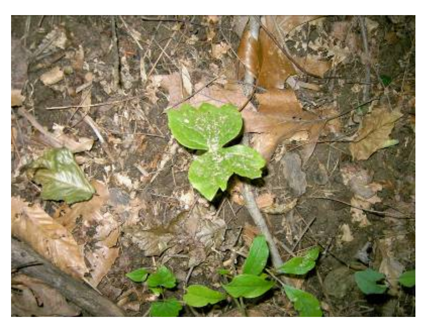
Figure 3: Browsed Vegetation

In 1990, long-term open vegetation plots were randomly located throughout the park to capture general changes in vegetation over time. There were not many deer documented in the park at that time, providing a good baseline of vegetation characteristics. Read every four years, data from the open plots indicate that in 1991, 2.9% of the stems in the plots were browsed, compared to 28% in 2003. During this time, shrub cover decreased 73% and tree seedlings in the open plots decreased from 8/m^2 to 5/m^2 . These data, weighted by height class, indicate that stocking rates, as defined by Susan Stout of the U.S. Forest Service,