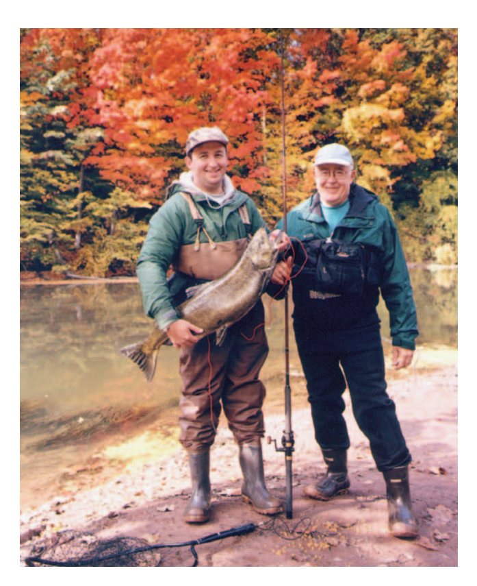
Sportfishing on the Niagara River

anglers, and birders. Joseph Davis State Park is the only public land within the study area that is open for hunting and is stocked annually with pheasant by NYSDEC. Other large public lands within Niagara and Erie Counties are also open to hunters.