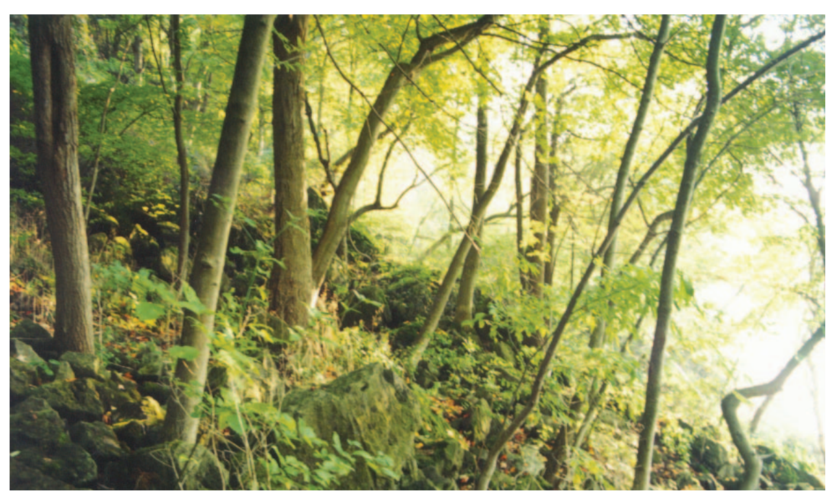
Flora in Niagara Gorge

the Niagara River, particularly for migratory waterfowl and gulls. Bird life inventories disclose 342 species including a wide variety of waterfowl and hawks, falcons, and eagles. Gulls, however, are the main attraction of the region to birdwatching visitors, with records of 19 separate species and one-day counts of over 100,000 individual birds. According to the New York Audubon Society, the area is particularly noteworthy as a migratory stop-over and wintering site for Bonaparte's gulls (Larus philadelphia), with one-day counts of 10,000-50,000 (2-10% of the world population). Additionally, two migrant waterfowl species use the river in globally significant numbers: canvasbacks (Aythya valisneria) and common mergansers (Mergus merganser). The Niagara River Corridor is an Important Bird Area (IBA) designated by the National Audubon Society. 4 The Society and the Canadian Nature Federation are cooperating in an effort to develop a comprehensive bird conservation plan for the corridor.