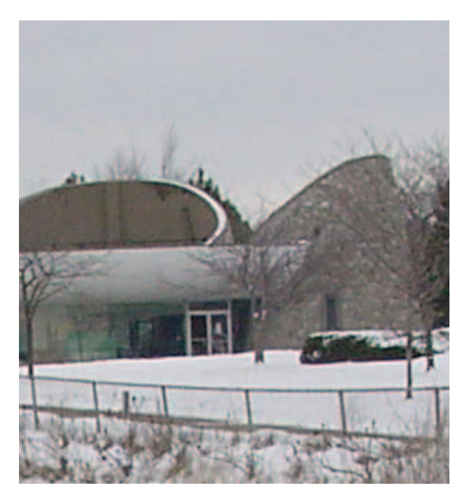
Niagara Gorge Discovery Center

Meanwhile, the New York State Office of Parks, Recreation and Historic Preservation has invested $44 million in improvements at the Niagara Falls State Park and other state-owned parks along the Niagara River Gorge. Investments include $23 million for rebuilding the Niagara Reservation Observation Tower, $6.5 million for the American Rapids Bridge, $1.5 million to revamp the Gorge Discovery Center, $1.1 million to restore the historic hay barn on Goat Island, $2.7 million for trolleys, and $1 million toward a new $6 million visitor center at Fort Niagara.