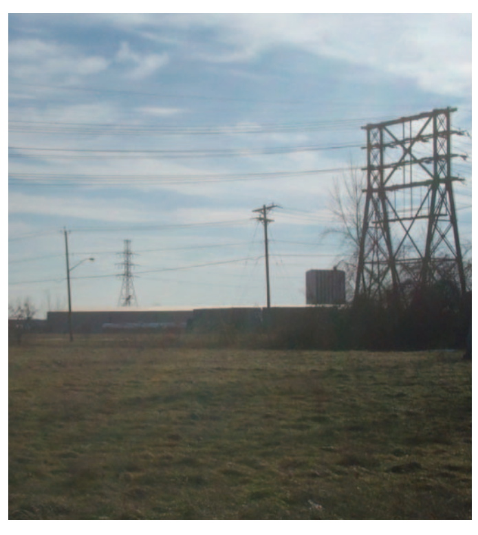
Niagara's Industrial Landscape

Deindustrialization and blighting impacts of industrial pollution have damaged the landscape and the economy of Niagara Falls (see Appendix H). The hazardous wastes in the Love Canal spawned the Superfund program in the late 1970s. Today Niagara County has 7 National Priority List Superfund Sites, 63 sites on the New York State Registry of Inactive Hazardous Waste Sites, and over 700 "brownfield" sites. Their cleanup will provide new land for economic development and expanding the tax base.