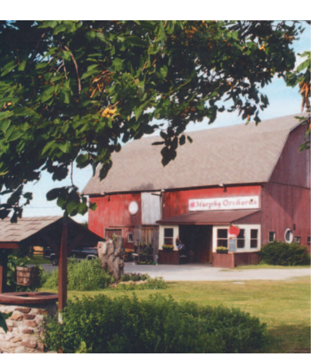
Murphy's Orchard, an Underground Railroad site