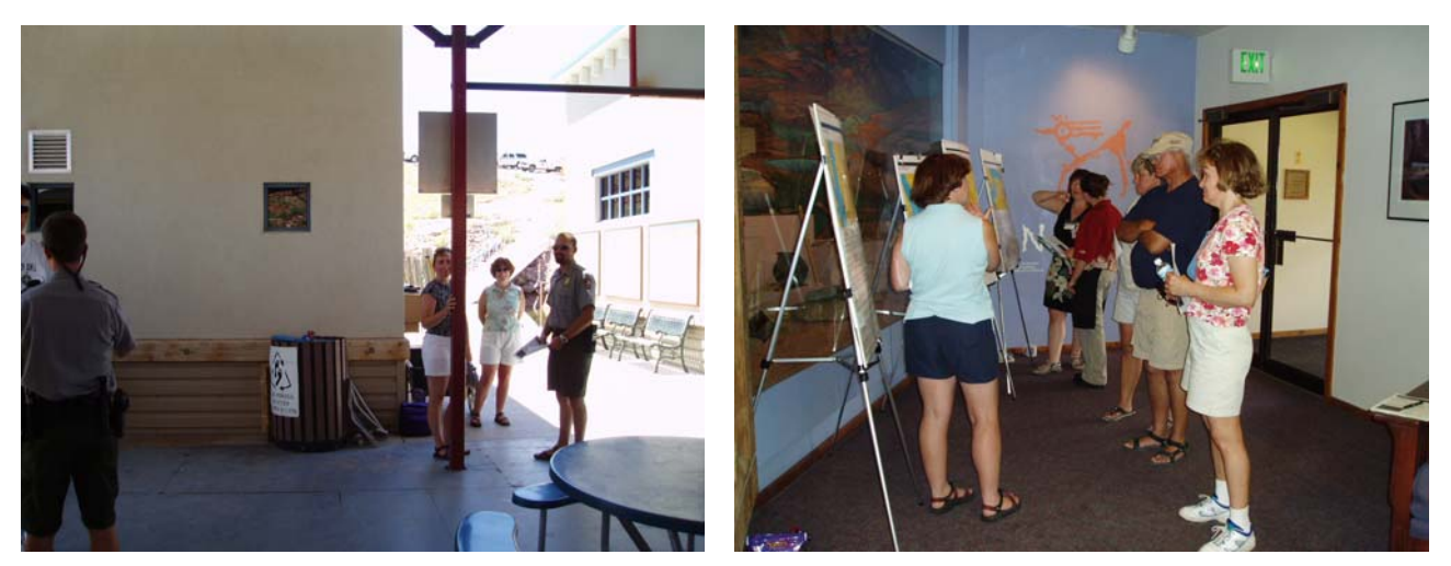
FIGURE 4. OPEN HOUSE EVENTS AT LAKE POWELL

A series of open house events were held in July 2004, at various locations in the Bullfrog and Halls Crossing developed areas. These informal sessions offered visitors using the uplake facilities an opportunity to look at maps, consider preliminary issues, and offer input on the effect of low water conditions on their Lake Powell experience (figure 4).