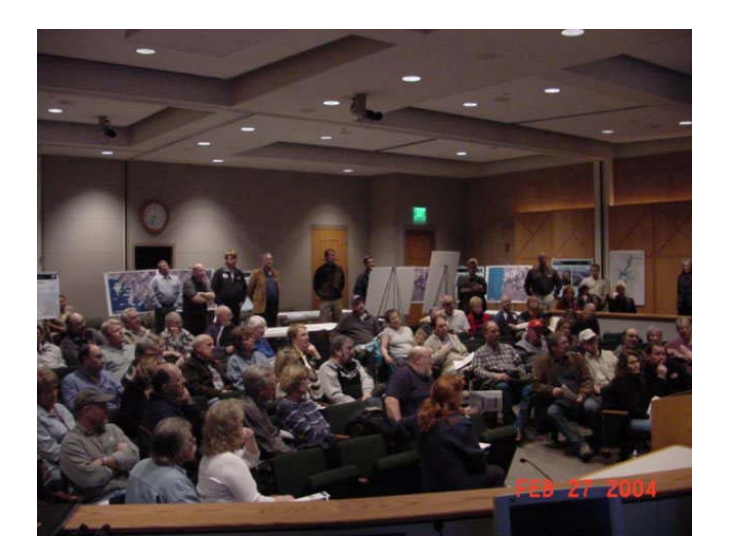
FIGURE 3. GRAND JUNCTION PUBLIC MEETING meeting minutes in Appendix D: Consultation.

Two public scoping workshops were conducted in February 2004. One was held in Bullfrog, Utah, and the other in Grand Junction, Colorado (figure 3). These meetings were conducted in an open house format with NPS personnel available at map stations, which addressed various aspects of the planning process and gave the public an opportunity to provide input.