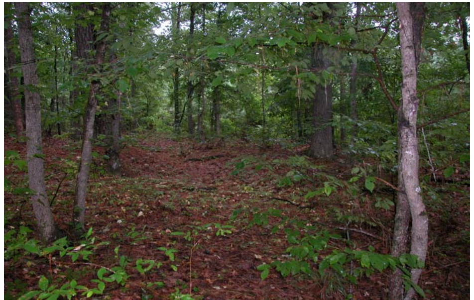
Traces of El Camino Real de los Tejas at Los Adaes invite you to follow a path through history.

To honor this heritage, the United States Congress authorized El Camino Real de los Tejas National Historic Trail in October 2004, under the National Trails System Act of 1968. The national historic trail is 1,000 miles long, and crosses Texas into Louisiana. It will be administered by the National Park Service, and it joins a system of national historic, scenic, and recreational trails crossing the United States.