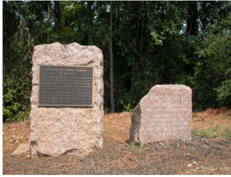
The various routes of El Camino Real de los Tejas have been identified and marked for modern-day travelers

El Camino Real provided the only form of overland travel and means of communication between the