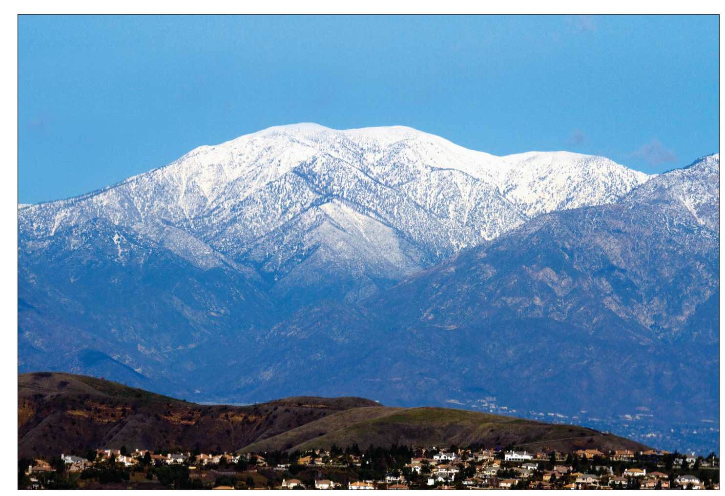
San Gabriel Mountains and Mt. Baldy.