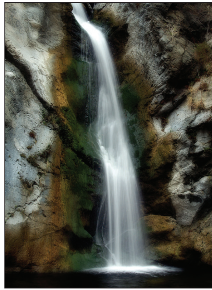
Eaton Falls.

Publication of the Draft San Gabriel Watershed and Mountains Special Resource Study will be followed by a public comment period. The NPS study team will then revise the report if needed, and transmit it to the Secretary of the Interior. The Secretary will transmit the report to Congress, along with the Secretary's recommendation for the area.