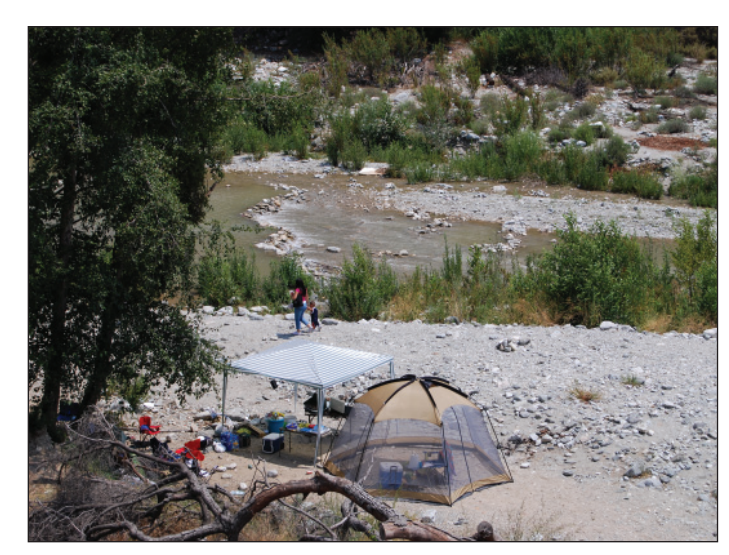
Day use activies, Angeles National Forest.

Within the San Gabriel Mountains, the NRA would include the Angeles National Forest (ANF) adjacent foothill areas with ecological resource values, and areas near the San Andreas Fault. Areas with ecological resource values include designated critical