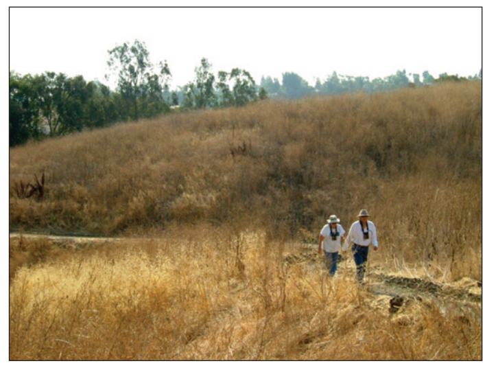
Hiking in the Puente Hills.

In existing public land areas, interagency agreements could augment agency staffing to manage highly used areas such as the San Gabriel Canyon, providing higher levels of visitor services, education, and safety.