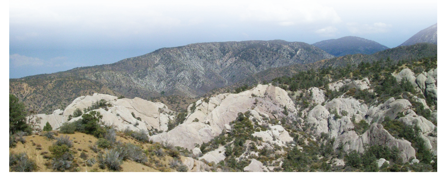
Devil's Punchbowl, San Gabriel Mountains. 2005.

After the distribution of the Draft San Gabriel Watershed and Mountains Special Resource Study there will be a minimum 60-day review period. The NPS study team will then revise the report if needed, and transmit it to the Secretary of the Interior. The Secretary will transmit the report to Congress, along with the Secretary's recommendation for the area.