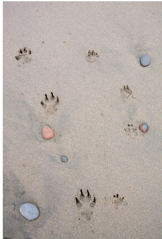
Tracks in the Sand at Fort Funston