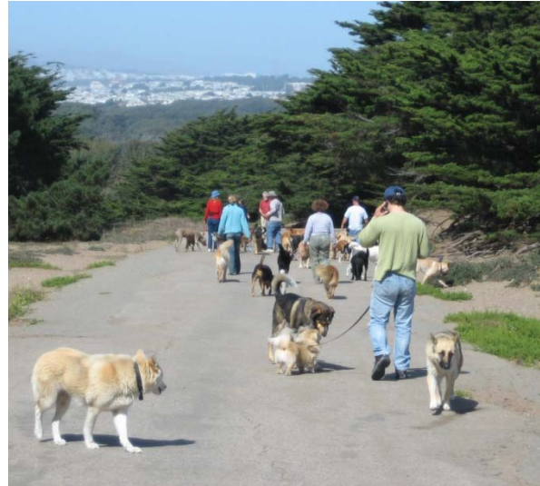
Dog Walkers at Fort Funston