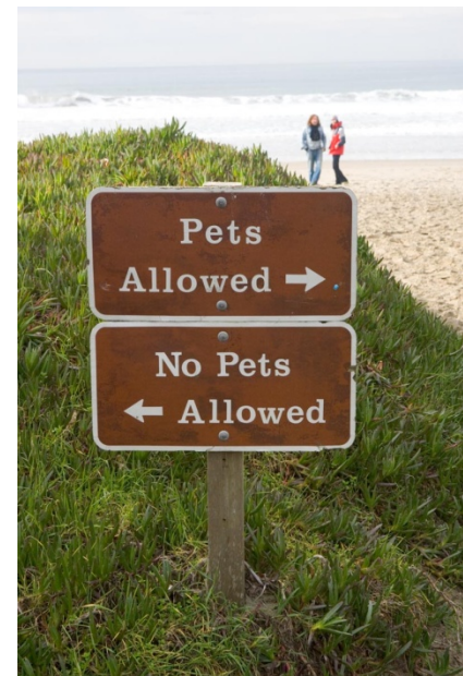
Signs at Stinson Beach

The public may also be largely unaware of the laws, regulations, and policies that guide the NPS in management of lands and resources, such as the GGNRA Compendium (NPS 2001b, 1). Members of the public may also not know that they must refer to the GGNRA Compendium, or to the park's web site, to find which areas are closed to dog walking (or closed to visitors). Adding to the possible confusion, closures may change from year to year, and portions of park sites, rather than an entire site, may be closed to the public for resource protection or visitor safety.