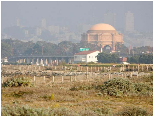
Crissy Field and San Francisco

Issue. Wildlife may transmit disease to dogs, and the quality of water where dogs play or drink may be poor. Dogs may pick up canine distemper virus and other diseases from infected wildlife. Wild birds, small mammals, and dogs can also introduce microorganisms into a water supply, and these microorganisms, algal blooms, and other naturally occurring phenomena can make dogs sick when they drink from affected streams or ponds.