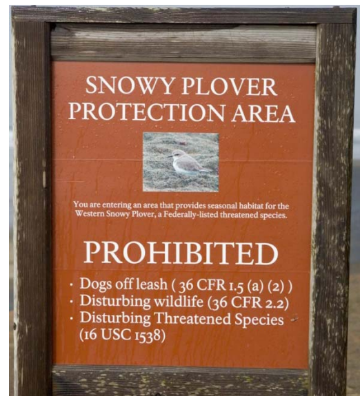
Protection Area Sign at Ocean Beach

The western snowy plover was listed as a threatened species under the federal Endangered Species Act (ESA) in 1993 due to loss of habitat by encroachment of non-native vegetation, predation, disturbance from recreational use of beaches, and development. The plover's threatened status affords it protection from harassment, defined under the ESA as "an intentional or negligent act or omission which creates the likelihood of injury to