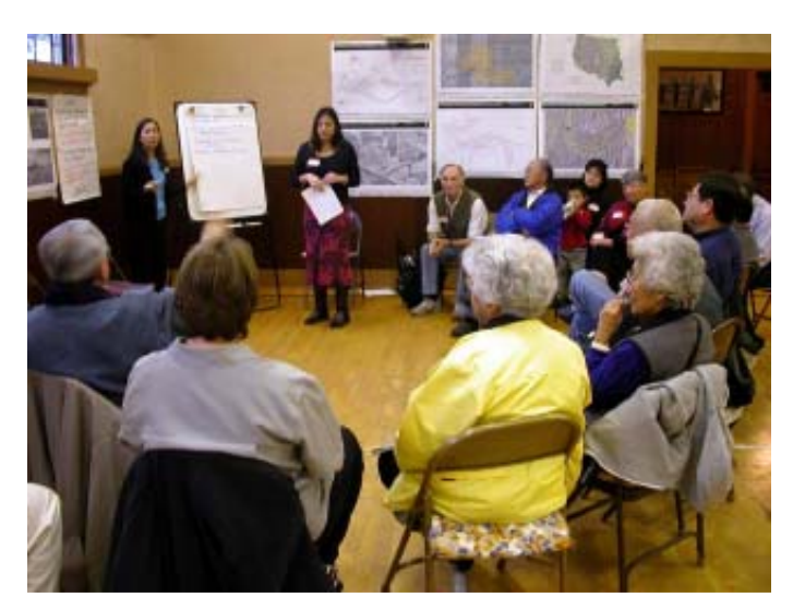
Public scoping workshop at the Nisei Veterans Hall in Seattle. November 2002.

The vast majority of comments addressed how important it is for the visitor to get a feel for the camp as it existed during the historic period. Many felt the need for an authentic experience where the visitor gets an accurate understanding of the day-to-day life and routines in the camp, including