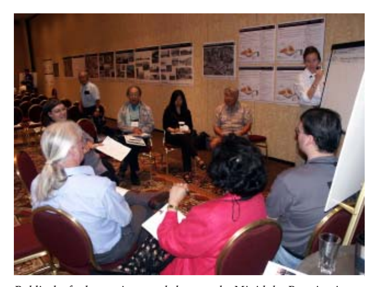
Public draft alternatives workshops at the Minidoka Reunion in SeaTac. August 2003.

Most people agreed that the pedestrian experience must be an integral part of visiting Minidoka. Many former internees suggested that pedestrian circulation should be emphasized, as it mirrors the internees' mode of transportation while they were