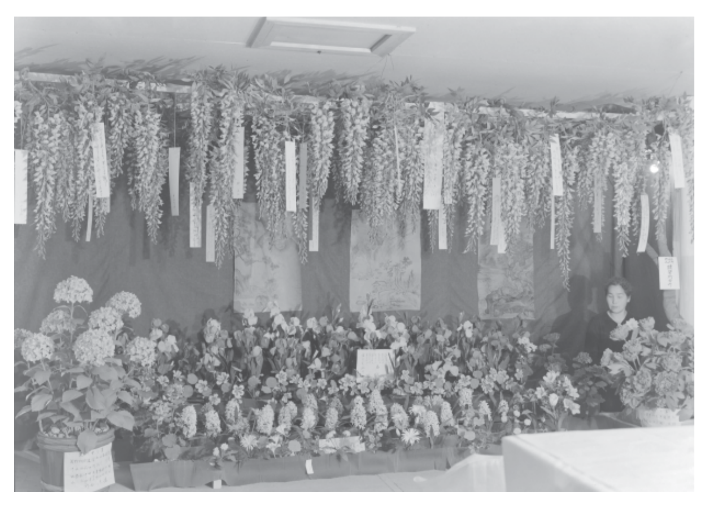
Paper flowers made by internees. Circa 1944.

"Every person should feel he's worthwhile and productive. No person should be shackled with a feeling of guilt without reason." -Public Comment