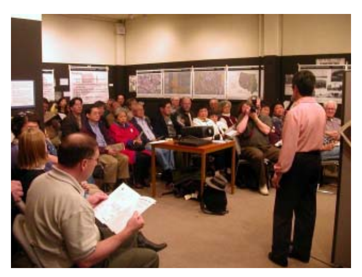
Public scoping workshop at the Oregon Nikkei Legacy Center in Portland. November 2002. NPS Photo.