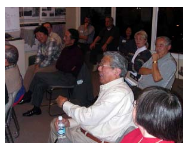
Public scoping workshop at the Oregon Nikkei Legacy Center in Portland. November 2002.

The public suggested a variety of facilities they wanted to include at or near the national monument. Many thought it is important to provide overnight lodging nearby such as motels or RV/tent campsites. A few respondents suggested the national monument include a gift shop, restaurant