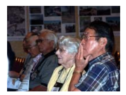
Public draft alternatives workshops at the Minidoka Reunion in SeaTac. August 2003.