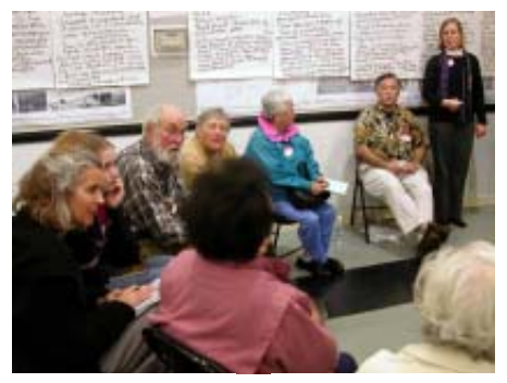
Public scoping workshop in Twin Falls. November 2002. (Top)