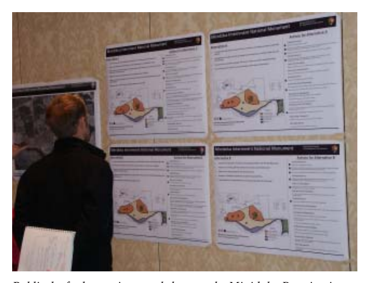
Public draft alternatives workshops at the Minidoka Reunion in SeaTac. August 2003.

Cultural resources and locations off-site were a significant concern to the public, in particular resources related to the internees' experiences at Minidoka. Barracks were of utmost concern; the public wanted historic barracks to be acquired and returned to Minidoka, preferably an entire block in its original location. Reconstruction of the barracks was a back-up preference if historic barracks are unavailable. The block and barracks should accurately depict living conditions, such as how the barracks were when the internees arrived, and how they were made livable. Some people also wanted