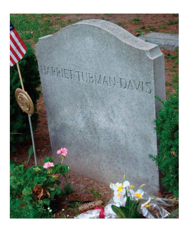
Figure 1-7. Tubman gravestone, Fort Hill Cemetery, Auburn, New York