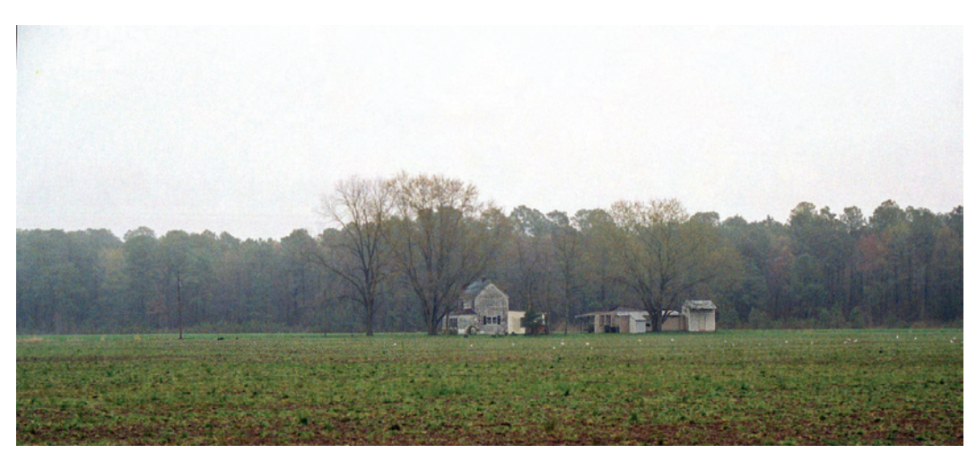
Figure 1-1. Brodess Farm, Greenbriar Road, Bucktown, Dorchester County, Maryland

The Dorchester County, Maryland, sites named in the study legislation are Brodess Farm and Bazel Church.