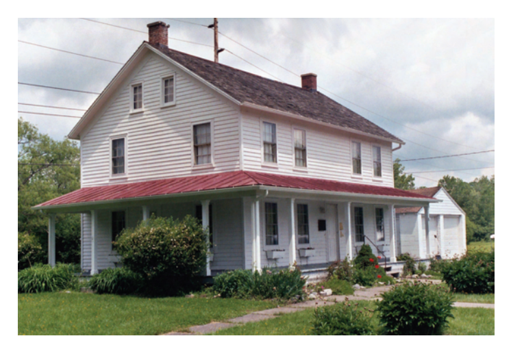
Figure 1-4. Harriet Tubman Home for the Aged, Auburn, New York