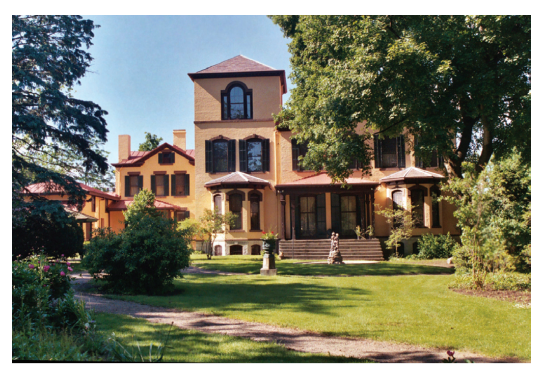
Figure 1-8. Seward House, Auburn, New York