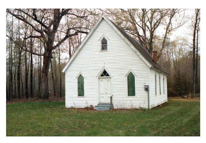
Figure 1-2. Bazel Church, Bestpitch Ferry Road, Bucktown, Dorchester County, Maryland