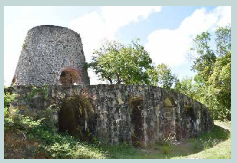
Catherineberg windmill from John Head Rd.

NPS seeks input on a potential land exchange between Virgin Islands National Park and the Territorial Government of the US Virgin Islands (GVI) on St. John.