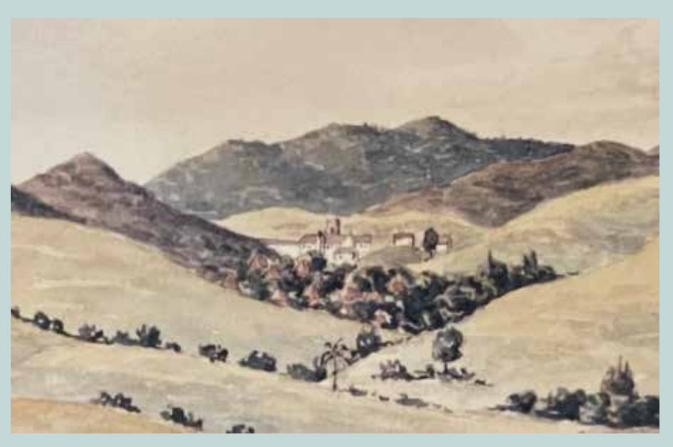
Watercolor painted by Frederik Von Scholten, 1838, zoomed in to show Catherineberg.