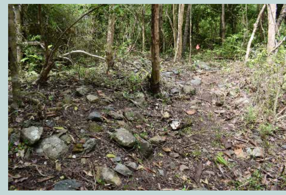
Stone foundation remnants in the enslaved laborers' village (Quinn Evans 2021).

Windmill at Catherineberg constructed between 1800 and 1826