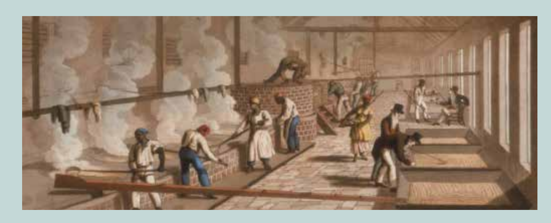
A period drawing showing the process of boiling, skimming, and cooling of sugar in a factory (St. Croix Landmarks Society).