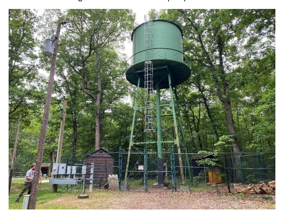
Figure 6. Oak Ridge water tower and pump house (on right)