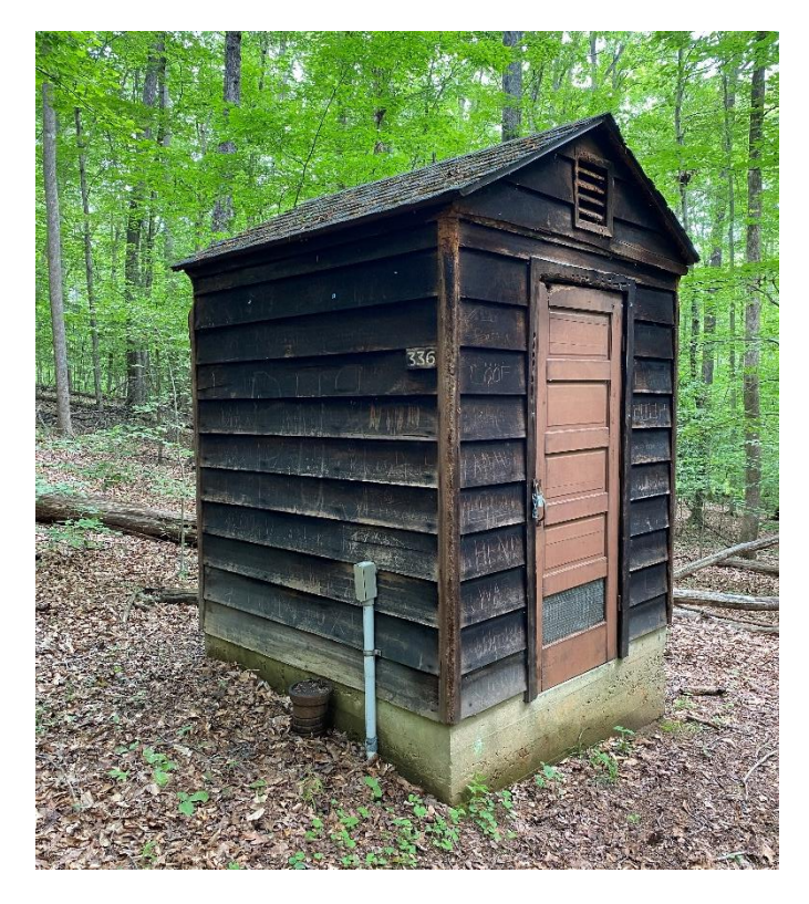
Figure 7. Turkey Run pump house