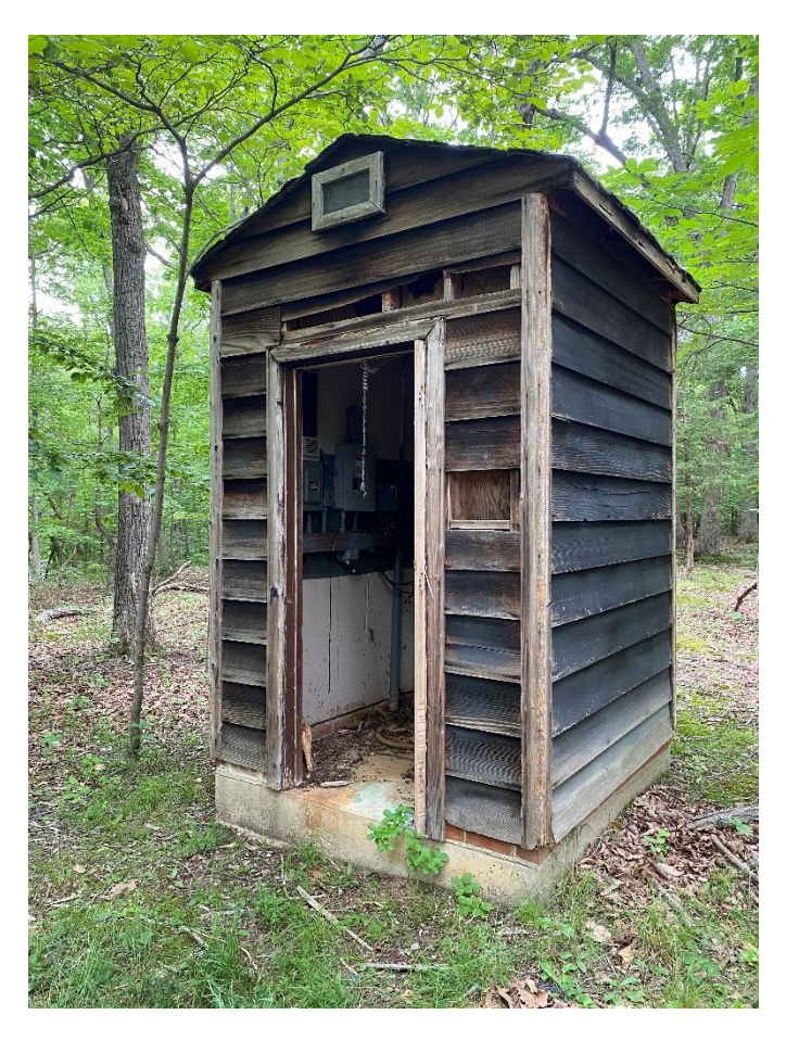
Figure 5. Williams Ballfield pump house