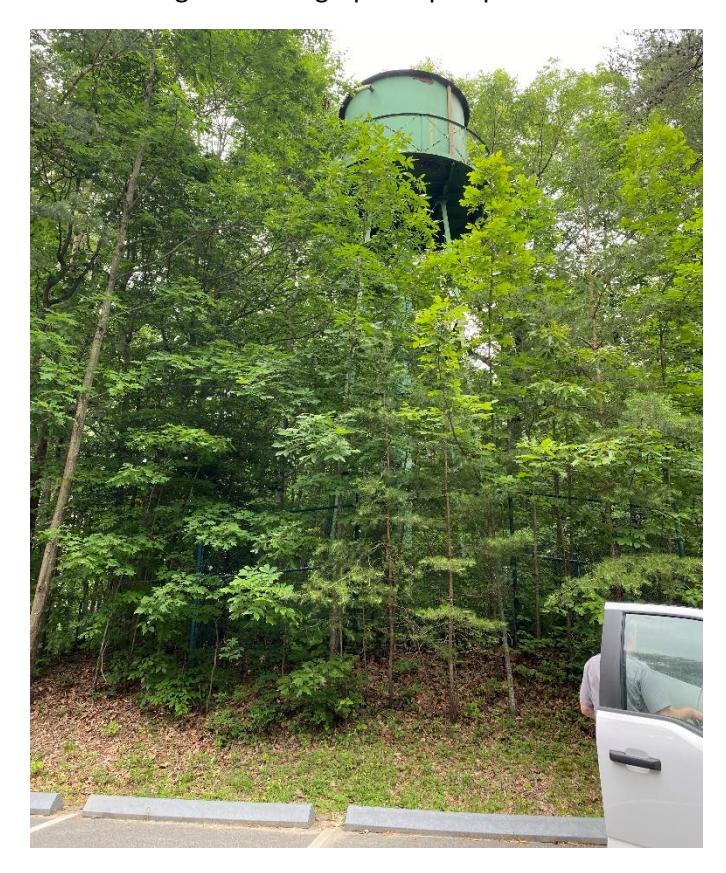
Figure 4. Telegraph Rd water tower