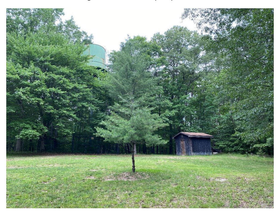
Figure 2. Pine Grove water tower with shed in foreground % \left( x_{1},x_{2}\right) =x_{1}^{2}