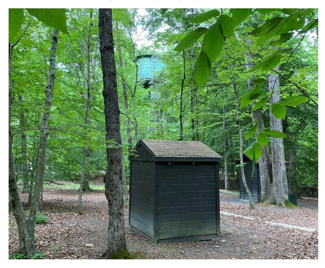
Figure 8. Turkey Run water tower with sheds in foreground