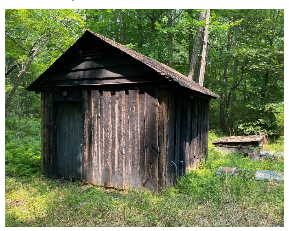
Figure 12. Camp 5 pump house on Mawavi Rd