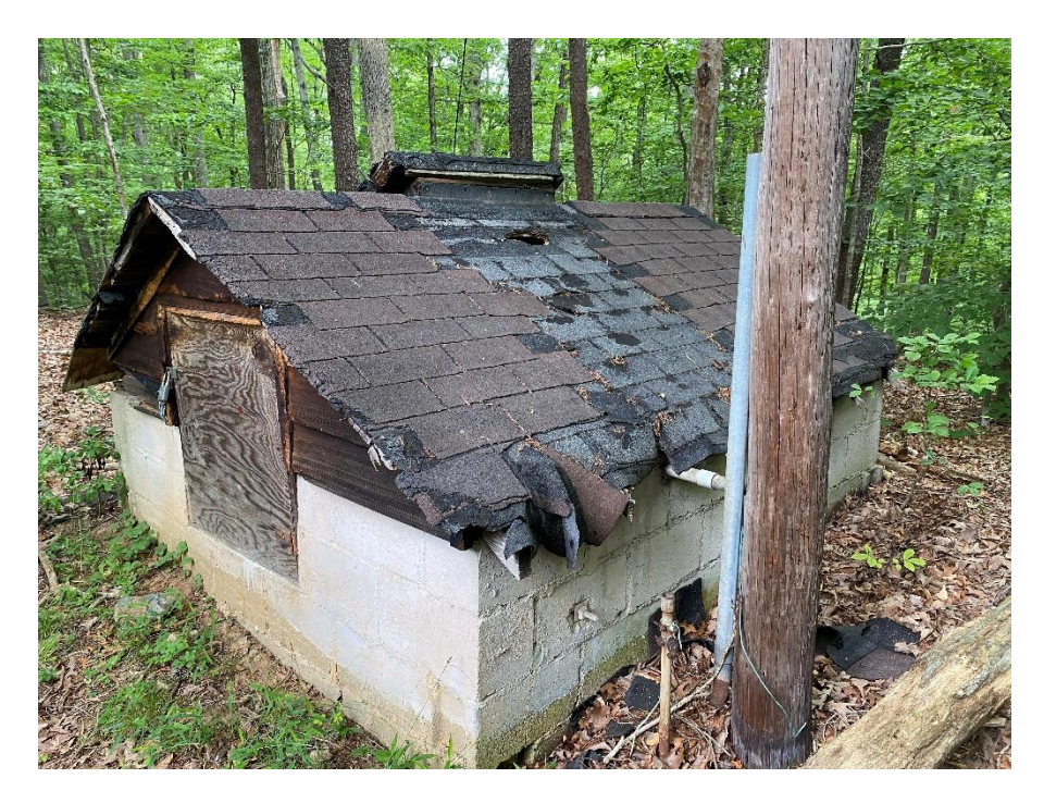
Figure 1. Pine Grove pump house