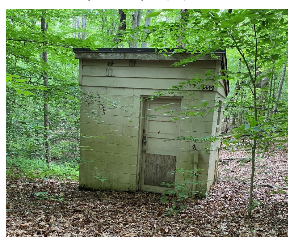
Figure 10. Camp 3 pump house