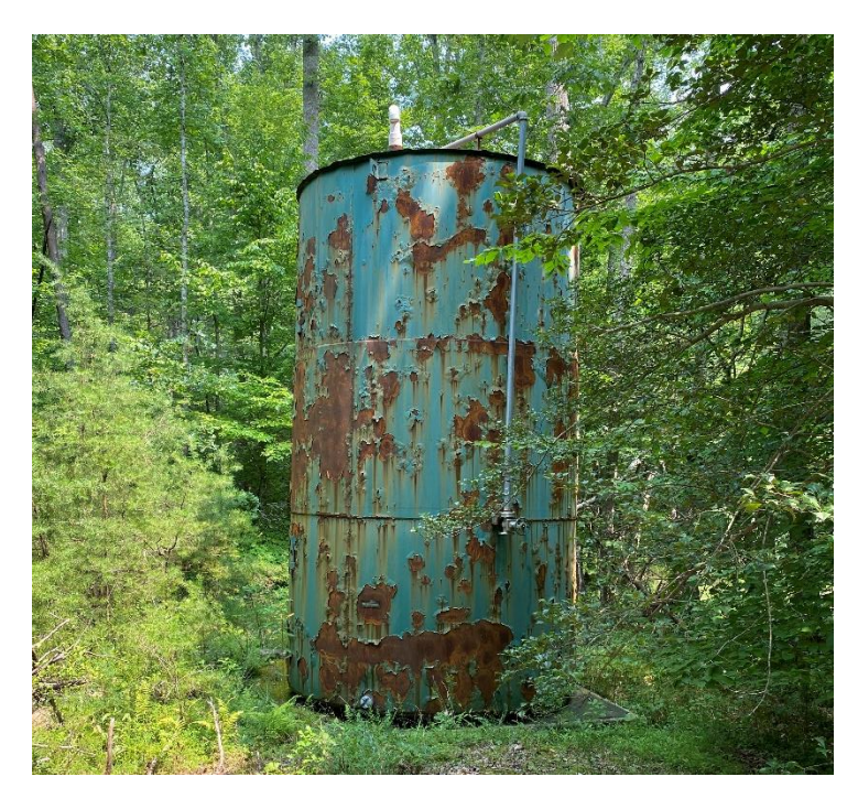
Figure 11. Metal water tank on Mawavi Rd