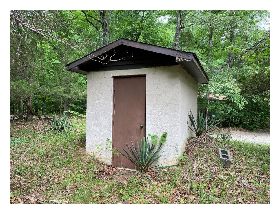
Figure 9. Building #334 pump house