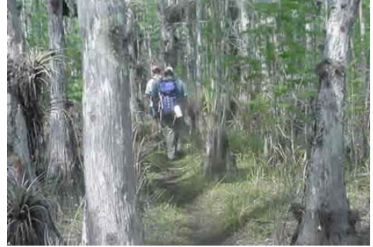
Hiking at Big Cypress National Preserve

Hunting is also a popular recreational activity in the preserve, although only 7% of those visitors surveyed rated it as “extremely important” or “moderately important.” Hunting seasons run from September through April. Fishing was rated by 16% and airboating was rated by 15% as “extremely important” or “moderately important.”