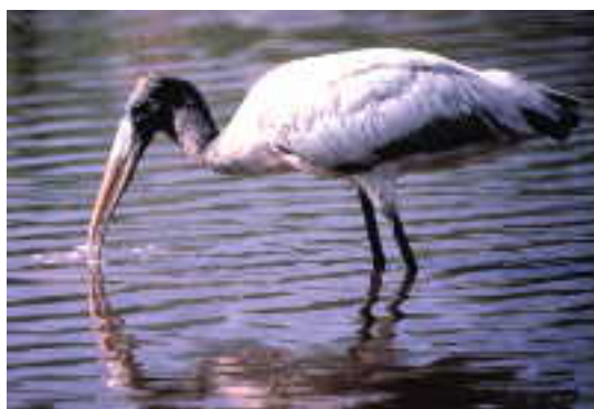
Wood stork at Everglades National Park