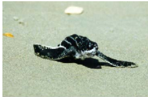
Leatherback sea turtle hatchling

Reptiles and amphibians that depend on this type of habitat for nesting or food include five species of federally listed sea turtles and various species of snakes, including the Florida rough green snake ( Opheodrys aestivus carinatus ) (Fairchild Garden 2005).