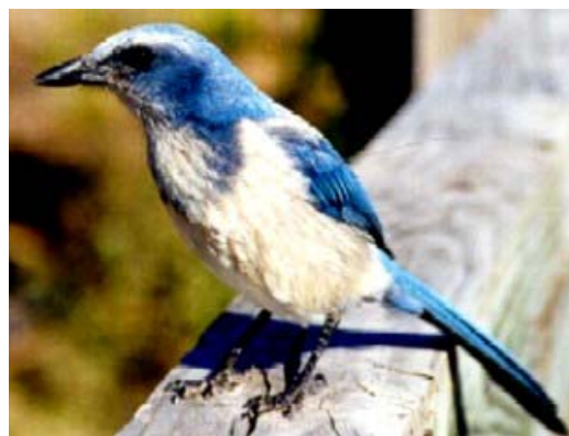
Florida scrub jay

The Florida scrub jay ( Aphelocoma coerulescens coerulescens ) is federally listed as threatened because of its decline and the loss and degradation of its habitat. This relative of the common blue jay has very specific habitat requirements, preferring brushy oak scrub, 5 to 15 years old, with large patches of open, sandy spaces. The majority of scrub oak habitat that has not been cleared for development has grown too high for the Florida scrub jay because of the suppression of the natural fire cycle. Brazilian pepper infestations also degrade the habitat for Florida scrub jays, and the manual removal of these species is recommended prior to burning. Insects comprise the majority of the scrub