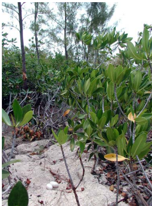
Crocodile eggs in an Australian pine stand

Biscayne National Park and Everglades National Park