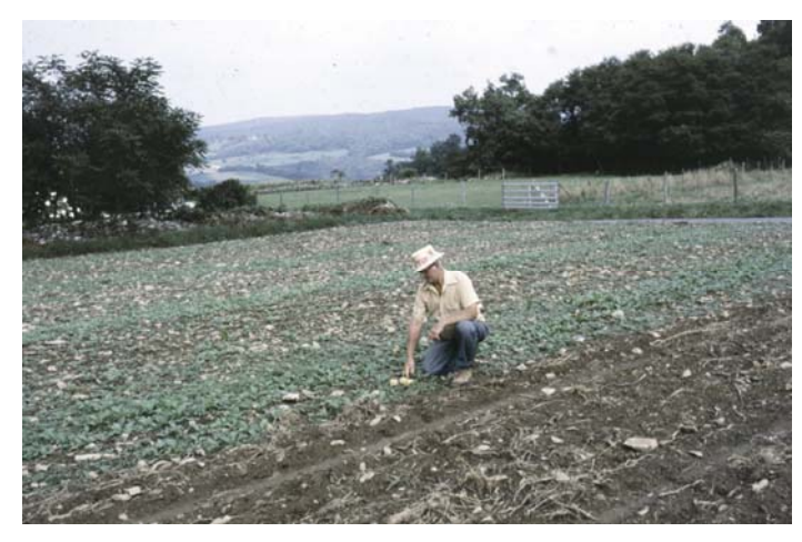
Agricultural landowners to the north and east of the park have experienced damage to crops and orchards from deer browse. Deer trample plants and eat foliage, flowers, and crops.

To determine the extent of crop damage from deer occurring statewide, 1,000 Maryland grain farmers were randomly selected to receive mail survey in March 1997 (McNew and Curtis 1997). All counties of the state were represented, including central Maryland, which encompasses Frederick, Washington, Carroll, Howard, Montgomery, Baltimore, and Hartford counties. Nearly 92% of farmers statewide indicated that they suffered deer damage in 1996, with the greatest damage reported by farmers in western Maryland and on the lower eastern shore. Table 20 indicates the average harvested yield for 1996 for those farmers surveyed in central Maryland, along with the