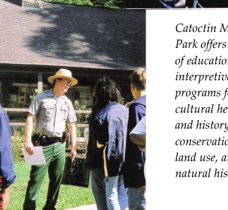
Catoctin Mountain Park offers a variety of educational and interpretive programs focused on cultural heritage and history, ecology, conservation and land use, and natural history.

Education and interpretation is also provided along the Brown's Farm trail, a short, self-guided interpretative trail at the Owens Creek picnic area. Interpretation along this trail explores several environmental concepts, including the impacts that an overabundance of deer can have on the ecosystem.