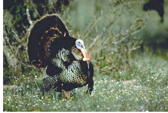
Heavy deer browsing adversely affects groundnesting or feeding birds, because of a lack of cover for protection from hawks, owls, coyotes, foxes, skunks, and raccoons.

The habitat most affected by heavy deer browsing is the herbaceous and woody vegetation in the forest understory. Deer can browse vegetation from ground level to an average of 60 inches (150 cm) above the ground, and this is the habitat that is primarily affected. Other wildlife also use this understory habitat.