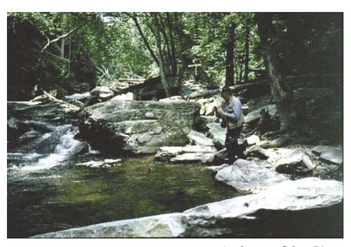
Anglers can fish at Big Hunting Creek and Owens Creek. Big Hunting Creek has played an important role in the development of recreational trout fishing in Maryland.

Catoctin Mountain Park receives a steady flow of visitors due to its proximity to major urban centers. Group campsites and cabin facilities are well used, and many visitors are drawn to the park for the activities described above. Noise from visitor use is concentrated in the park's developed areas, particularly along the east and west ends of Park Central Road, where visitors can access Camp Misty Mount, Camp Greentop, and Camp Round Meadow. Foxville-Deerfield Road, which is near the park's western boundary, also provides access to the Owens Creek campground (NPS 2005g).