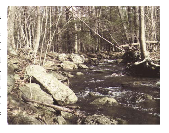
Big Hunting Creek consists of four permanent named and numerous intermittent unnamed tributaries.

Two main permanent streams flow through the park and drain its two principal watersheds — Big Hunting Creek and Owens Creek (see the "Park Location Map" on page 7). The water quality in these streams is very good, and both are classified by the state as Class III-P "natural trout waters." This indicates that the waters are suitable for the growth and propagation of trout, capable of supporting self-sustaining trout populations and their associated food organisms, and suitable for use as a public water supply. The primary concern related to water quality and the deer management plan centers on the potential for increased sedimentation and turbidity levels within the creeks, which can be affected by erosion due to loss of vegetative ground cover due to deer browsing.