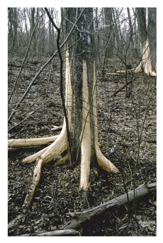
Bark stripping is indicative of the extent of an overbrowsing problem, making trees more susceptible to disease and mortality.

A comparison of deer forages listed by Bramble and Goddard (1953) to those observed in the park revealed that several, less-preferred forages had been heavily browsed in the park (Langdon 1983, 1985). White pine, eastern hemlock, mountain laurel, rhododendron ( Rhododendron spp.), wild azalea ( Rhododendron spp.), and gooseberry ( Ribes spp.) in Catoctin all showed moderate to heavy browsing pressure by deer. These species are all listed by Bramble and Goddard (1953) as less preferred deer forages (i.e., normally less than 2% utilization). Thus, this habitat indicator also supports the conclusion that the deer herd is overpopulated and that deer are forced to use less preferred forage (Warren and Ford 1990).