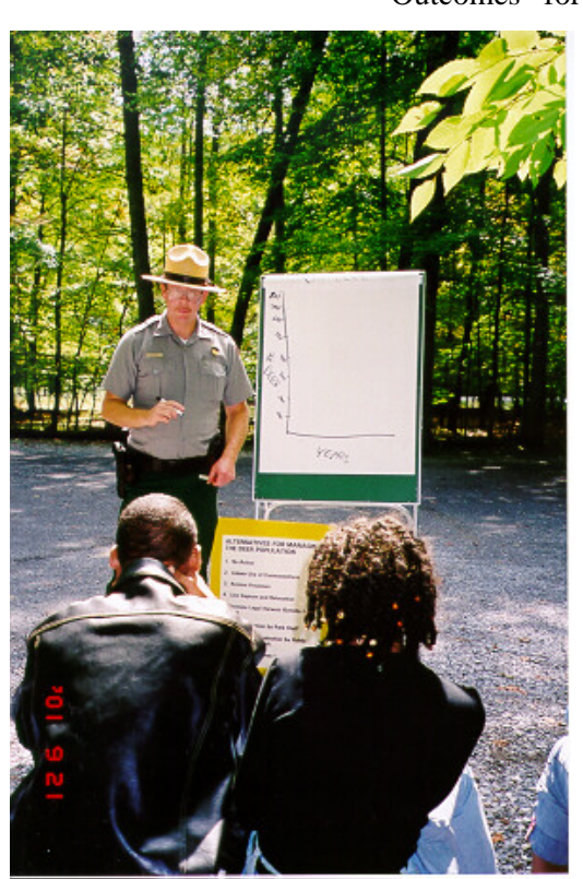
One of the park's goals is that visitors leave the park with the idea that it is valuable to preserve and interpret our cultural and natural heritage.