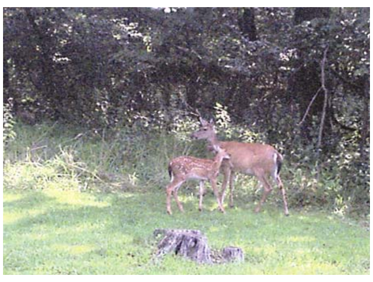
The white-tailed deer is one of the most adaptable mammals in the world and is most abundant in eastern woodlands.

White-tailed deer are medium-sized ungulates, native to North America and regarded as one of the most adaptable mammals in the world (Hesselton and Hesselton 1982). Among the reasons for this adaptability are the hardiness, reproductive capability, wide range of plant species accepted as food, and the tolerance deer express for close contact with humans.