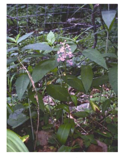
In 1989, 12 remaining large purple-fringed orchids were discovered in the park. Wire cages were installed around them to protect them from deer browsing.

Table 14 lists the species of special concern identified by the Maryland Department of Natural Resources and Catoctin Mountain Park staff. Where information was available, the table also provides the state status or rank for the species, preferred habitat, and palatability to deer. Six species documented in the park are identified as palatable to white-tailed deer — long-bracted orchid, leatherwood, large-leaved white violet, American ginseng, large purple-fringed orchid, and nodding trillium.