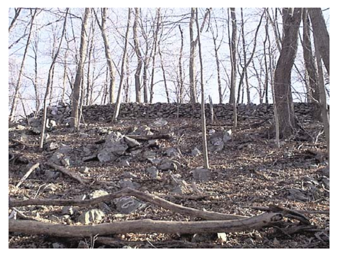
All of Catoctin Mountain Park is a cultural landscape that is potentially eligible for the National Register of Historic Places.

park cultural landscape also contains two component landscapes, the cabin camps at Camp Misty Mount and Camp Greentop, which were both listed on the National Register of Historic Places in 1988. Features identified as contributing to the park's cultural landscape during the inventory are identified in table 17. The following information, unless noted otherwise, was derived from that report (NPS 2000a).