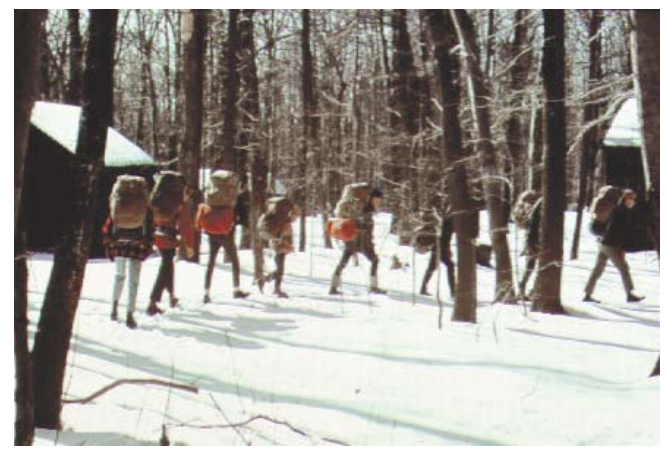
One of the most common activities Catoctin's visitors engage in is hiking.

April 15; the courses are closed the rest of the year to lessen impacts on forest vegetation and wildlife. Basic orienteering (map and compass reading) courses are offered at the park visitor center in March and November. The west side course is within the area bounded by Park Central Road, Manahan Road, and Foxville-Deerfield Road (NPS 2005d). The courses are used on a first-come, first-served basis if no advance reservations are made (NPS 2005d).