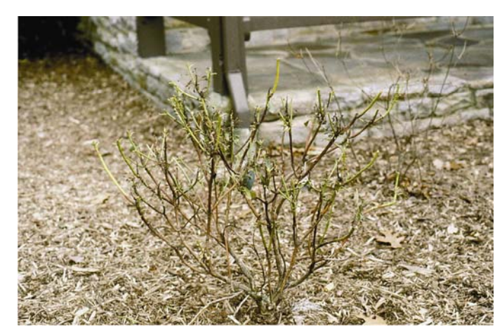
Since the early 1980s park staff have noted evidence of heavy deer browsing and the effects it was having on woody and herbaceous species.

Some of Catoctin's wildflowers include spring beauties ( Claytonia virginica ), cutleaf toothwort ( Cardamine concatenate ), wild geranium ( Geranium maculatum ), bloodroot ( Sanguinaria spp.), wild ginger ( Asarum canadense ), rue anemone ( Isopyrum biternatum ), wood anemone ( Anemone quinquefolia ), yellow violet ( Viola pubescens ), yellow adders tongue ( Erythronium americanum ), cardinal flower ( Lobelia cardinalis ), hepatica ( Hepatica spp.), jack-in-the-pulpit ( Arisaema triphyllum ), mayapple ( Podophyllum peltatum ), and several species of orchid (NPS 2005d).