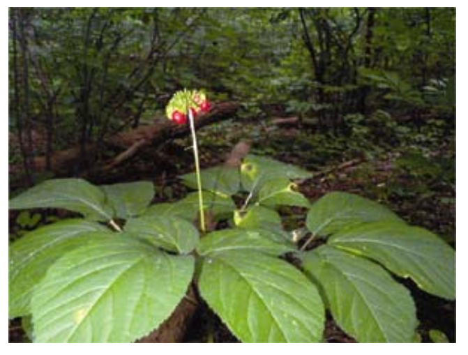
American ginseng has all but disappeared from Catoctin Mountain Park

No federally listed species have been documented in the park, based on correspondence with the U.S. Fish and Wildlife Service (see appendix B). The Maryland Department of Natural Resources' Wildlife and Heritage Service identifies one state-listed animal species, common raven ( Corvus corax ), and six plant species as potentially occurring in or in the vicinity of the park including