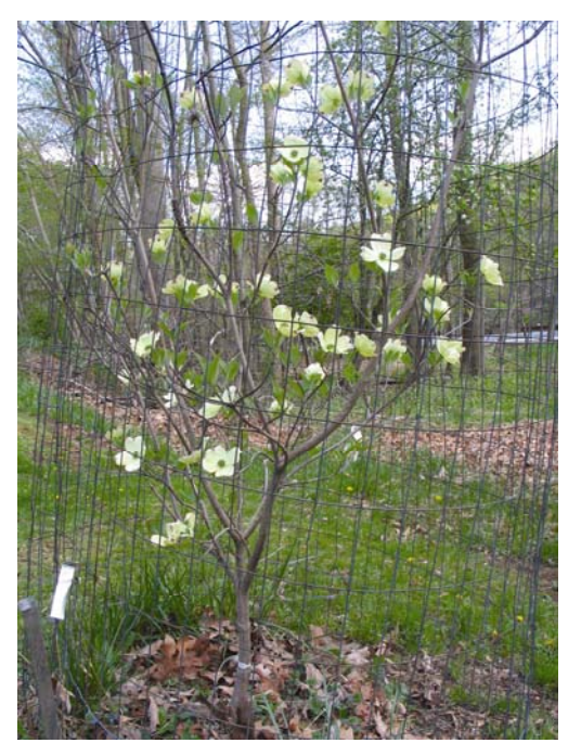
Under all alternatives small fenced areas would continue to be used to protect selected trees, landscape vegetation, and rare native plants or habitats.

The actions that would continue under alternative A are described below in detail. These actions would also continue under all other alternatives as well.