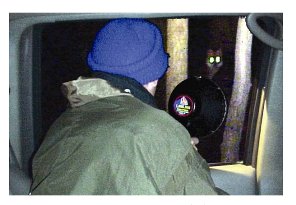
Deer spotlight surveys would be conducted annually to collect data to estimate the deer population density using the distance sampling method.

Communication with and input from other organizations and the public would be a key component of alternative A, as well as the other alternatives. Such activities would include continuing education and interpretive programs, displaying exhibits at visitor centers, producing brochures and publications, and conducting teacher workshops and education about the negative effects of feeding deer. The park would continue to sponsor campfire programs, offsite programs for schools, and exhibits for the local community, which would incorporate information about deer management activities. The park's website would also be used to discuss what the park is doing related to deer management, and relevant articles would be published in local newspapers.