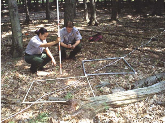
Current monitoring of vegetation impacts and deer population levels would be expanded as necessary.

would be adjusted based on the success of previous removal efforts, projected growth of the population, and vegetation and deer monitoring results.