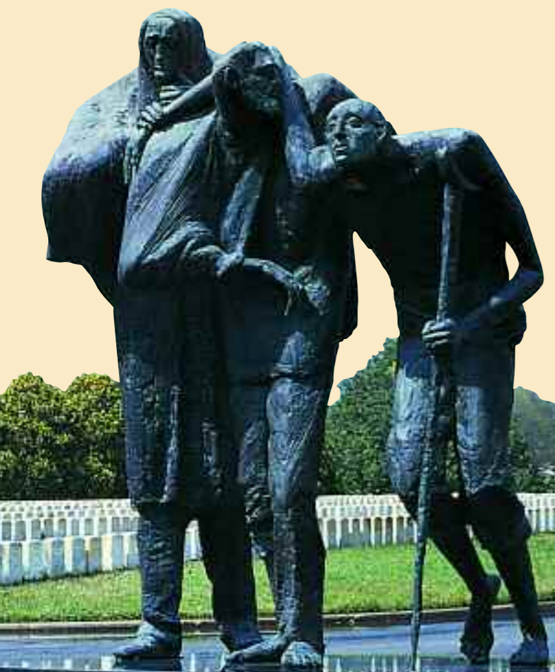
Andersonville National Cemetery

To be feasible as a new unit of the National Park System an area's natural systems and/or historic settings must be of sufficient size and appropriate configuration to ensure long-term protection of the resources and to accommodate public use. It must have potential for efficient administration at a reasonable cost. Important feasibility factors include landownership, acquisition costs, life cycle maintenance costs, access, threats to the resource, and staff or development requirements.