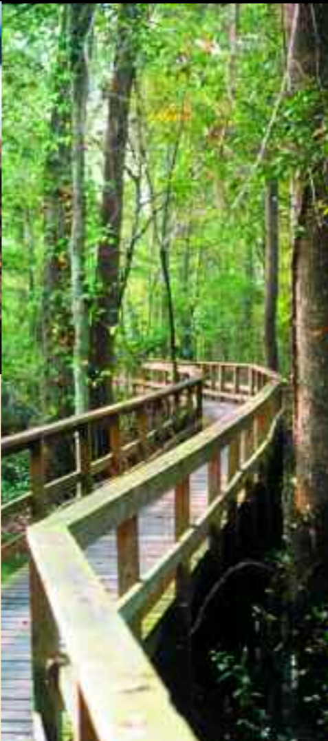
Congaree National Park