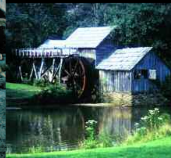
Mabry Mill, Blue Ridge Parkway

Throughout the Nation, people are working to conserve natural resources, protect historic sites, and to provide recreational opportunities for a growing population. Many communities also are looking for ways to combine conservation with efforts to attract visitors who will help support the local economy. The National Park Service is responsible for carefully screening proposals for new park units to assure that only the most outstanding resources are added to the National Park System. Regardless of economic considerations or other factors, a new national park area must meet criteria for national significance, suitability, and feasibility. Various other management options are also weighed. For those with proposals for consideration, this page explains the criteria applied by the National Park Service in evaluating new park proposals, outlines the study process, and lists some of the other ways to recognize and protect important resources outside of the National Park System.