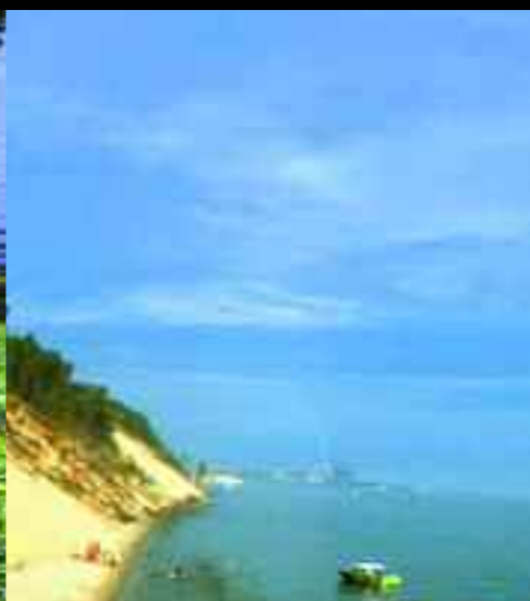
Indiana Dunes National Lakeshore