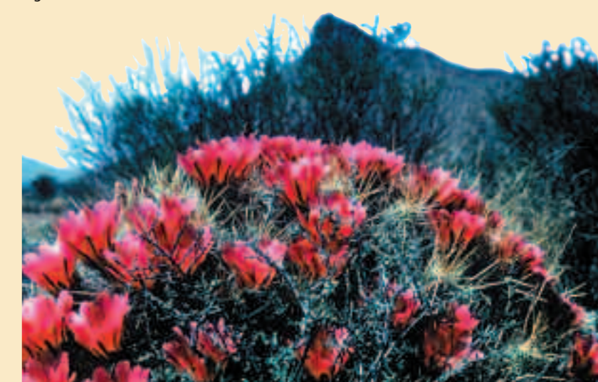
Big Bend National Park