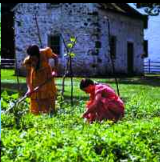
Hopewell Furnace National Historic Site