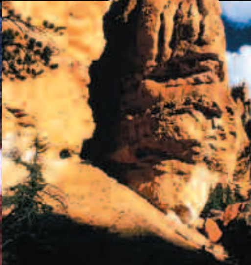
Bryce Canyon National Park