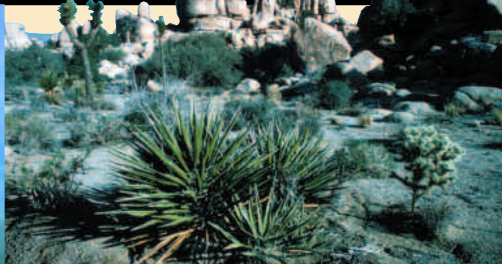
Joshua Tree National Monument