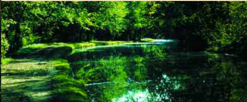
Capitol Reef National Park