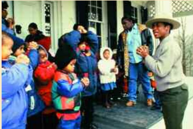
Frederick Douglass National Historic Site

Congress has used more than 20 different designations in adding areas to the National Park System. These titles are usually descriptive: seashore, lakeshore, historic site, battlefield, and recreation area, for example. The designations have not always been used consistently, but they reflect certain precedents followed by Congress. The title of national park has traditionally been reserved for the most spectacular natural areas with a wide variety of features. Hunting, mining, and other consumptive uses such as grazing are generally prohibited in national parks. National monuments are usually smaller areas established primarily to protect historic, scientific, or natural features containing fewer diverse resources or attractions than national parks. Legislation authorizing national preserves, recreation areas, seashores, and lakeshores sometimes allows for a wider range of activities such as oil and gas development, grazing, and hunting subject to certain limits. Despite these differences, all units of the National Park System are managed so as to "leave them unimpaired for the enjoyment of future generations."