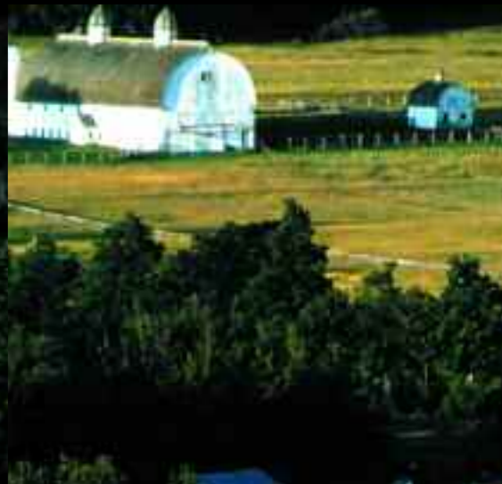
Sleeping Bear Dunes National Seashore