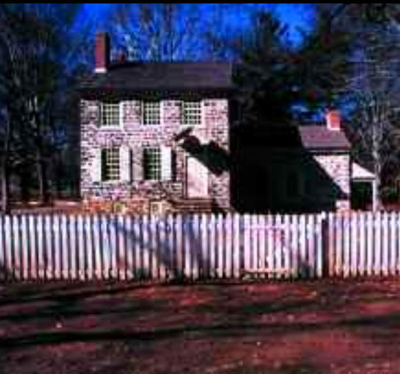
Valley Forge National Historical Park