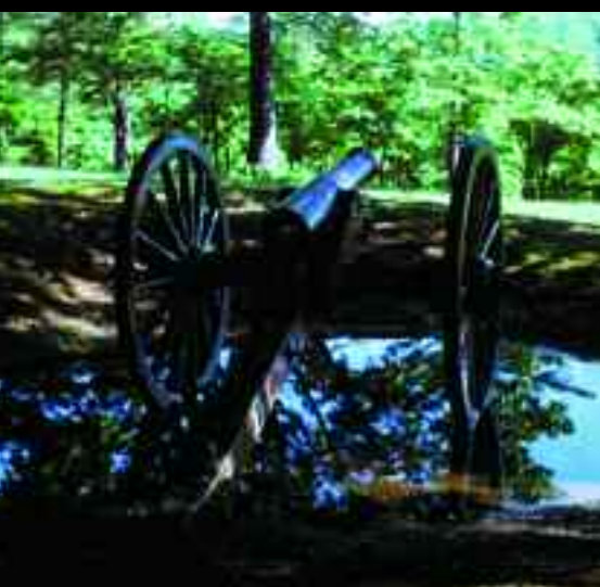
Fredericksburg and Spotsylvania County Battlefields Memorial National Military Park