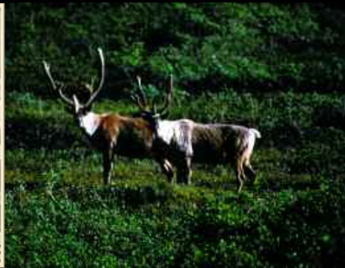
Denali National Park