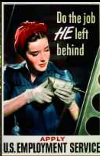
Rosie the Riveter/World War II Home Front National Historical Park National Archives